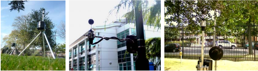
Figure 1 – DREAMSys deployed at the NPL site

Figure 1 shows two mounting options (left and centre) and a DREAMSys unit deployed alongside a type 1 sound level meter system at NPL (right).