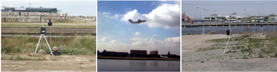
Figure 4 – Silvertown Quays. The location of the principal DREAMSsys trial

using the tripod arrangement, with the feet secured with either ground anchors or sand bags depending on the ground hardness. Measurements have been in progress since August 2009.