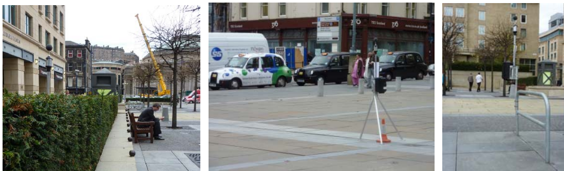
Figure 3 – DREAMSys installations in Festival Square

Given the public access, the site was attended for the duration of the trial. While this afforded some protection of the equipment, it also enabled interaction with the public to explain the purpose of the system and its potential benefits. While there were naturally concerns over privacy, these were quickly allayed, and the exercise received a generally positive response.