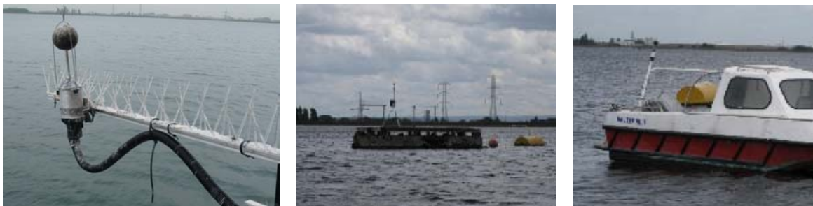
Figure 2 – A variety of mounting solutions at Wraysbury Reservoir

The site also presented a number of challenges for mounting the equipment, and protecting it from wildlife (mostly seagulls). Figure 2 shows some of the installations used, including one unit mounted to a tethered boat. It should be noted that while this was a privately owned site, evidence of unauthorized access prevented the deployment of DREAMSys unit in locations outside a well controlled area.